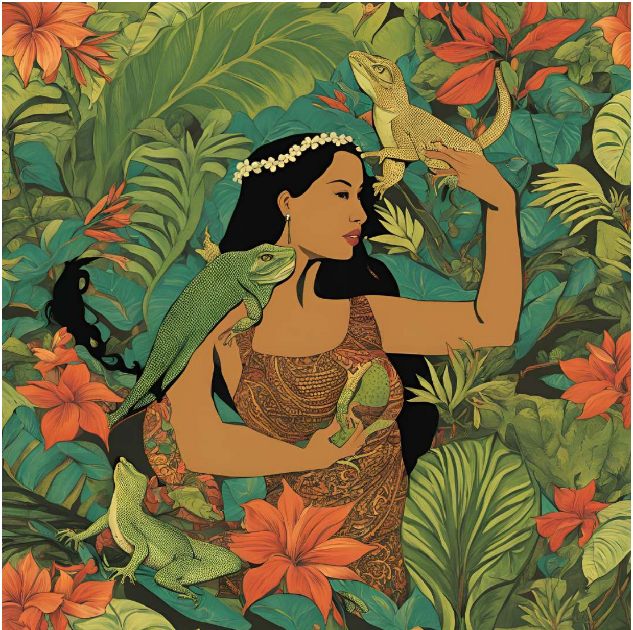
Mo'o Wahine: Lizard Women of the Streams

The Night Marchers are not just ghostly apparitions; they are the embodiment of the past, carrying with them the weight of history and the power of the ancient Hawaiian warriors. Their presence is a testament to the enduring spirit of the Hawaiian people and the profound connection they have with their ancestors. For those who live on the islands, the Night Marchers are a reminder that the past is never far away, and that the spirits of those who came before still walk among us, protecting and guiding their descendants.