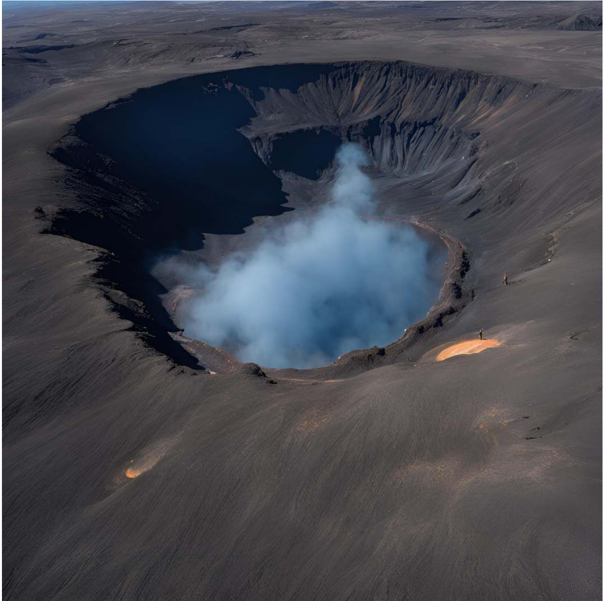
The Ghostly Presence at Halema'uma'u Crater

The haunting beauty of Waipio Valley, with its cascading waterfalls, lush vegetation, and mist-covered cliffs, continues to captivate the imagination and inspire reverence. It is a place where the boundaries between the physical and spiritual worlds blur, where the past and present coexist in a harmonious dance. The spirits of Waipio Valley, ever watchful and protective, remind us of the enduring legacy of the Hawaiian people and the sacredness of the land they call home.