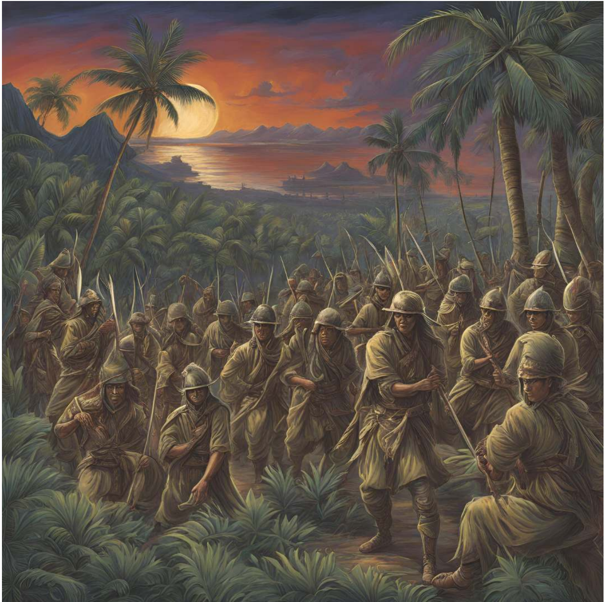
The Night Marchers: Ghostly Warriors of the Night

The legend of Pele, the volcano goddess, is a testament to the power of nature and the enduring strength of cultural traditions. Her story is a vivid reminder of the forces that have shaped the Hawaiian Islands and the deep spiritual connection that the Hawaiian people have with their land. Whether seen as a destructive force or a nurturing presence, Pele's legacy continues to burn brightly in the hearts and minds of those who call Hawaii home